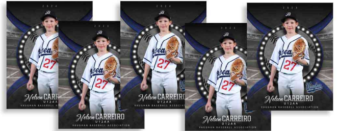
5 TRADING BASEBALL CARDS