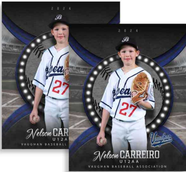
2 - 5x7 PORTRAIT PRINTS