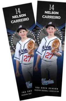
2 - BOOKMARKS